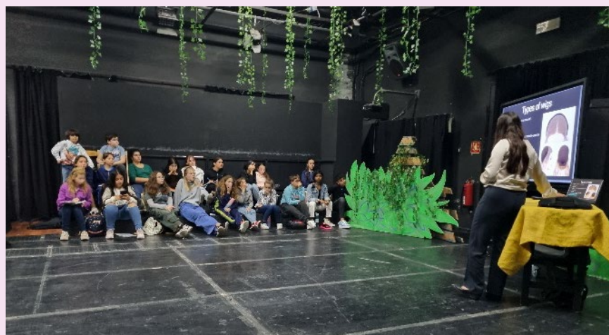
Make-up & Hair