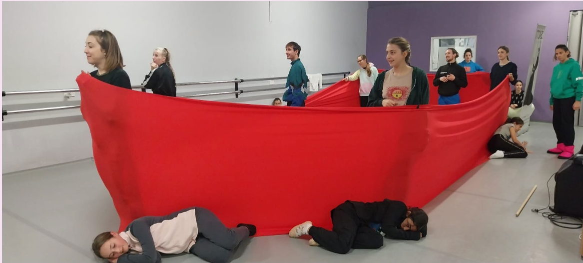
Drama & Choreography Practices